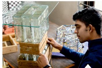
Architecture, Fine Arts & Design Expo