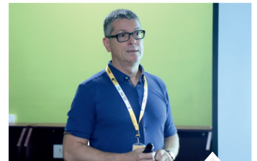
An Exposure to Global Experts