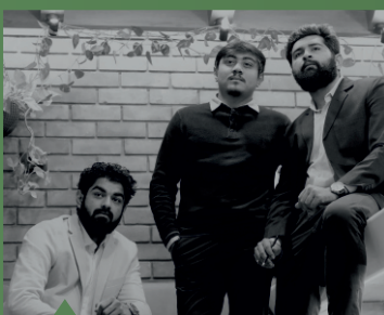
Architectural Start-Ups: Next Step Architects