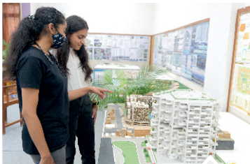
AAKAR – Annual Architecture Festival