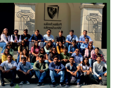
Global Architectural Exposure: Exchange Program in Poland