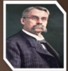
DR. J.T. KENT PIONEER OF REPERTORY

DEPARTMENT OF HOMOEOPATHIC CASE TAKING & REPERTORY