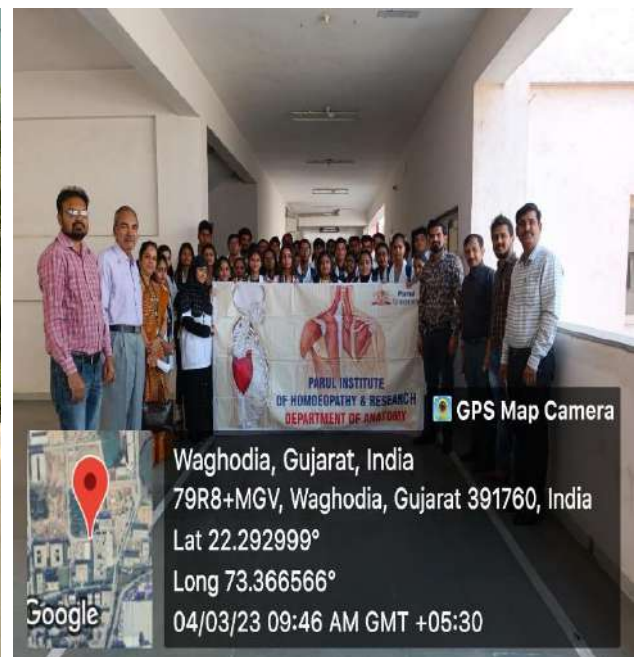
FACULTY OF ANATOMY OF PIMSR