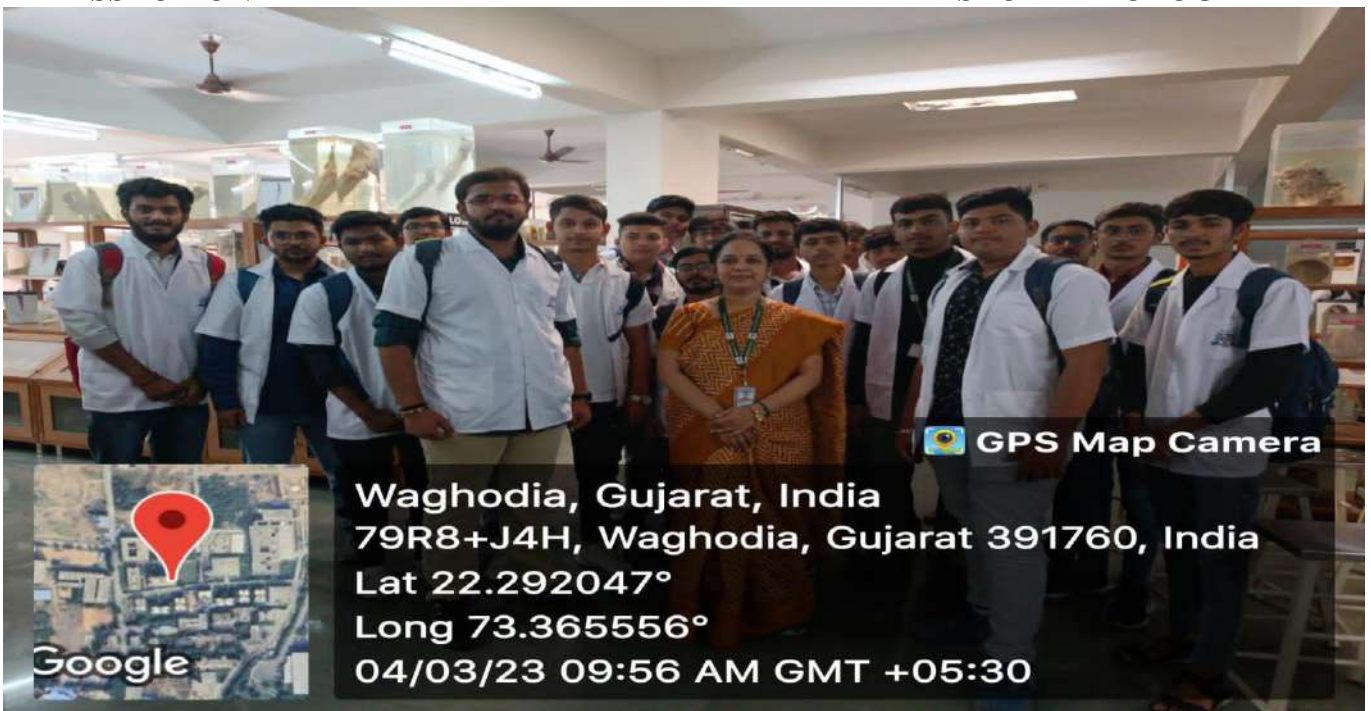
AT ANATOMY MUSEUM