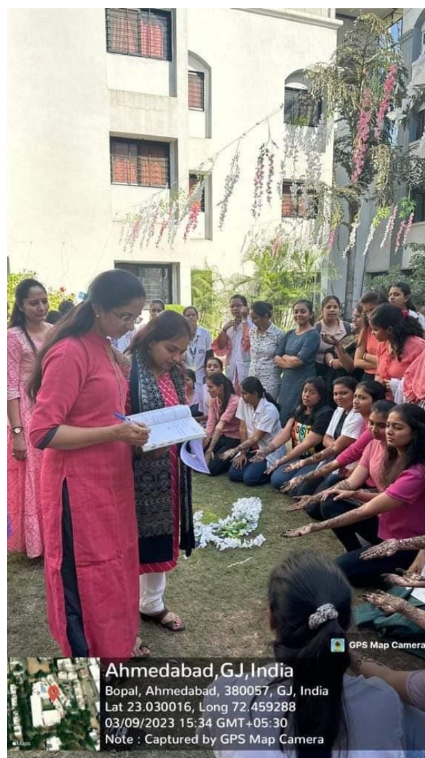
Ahmedabad, GJ, India Bopal, Ahmedabad, 380057, GJ, India Lat 23.030016, Long 72.459288 03/09/2023 15:34 GMT+05:30 Note : Captured by GPS Map Camera

Makeup Competition: The Makeup competition at the International Women's Day celebration was a captivating event that displayed the